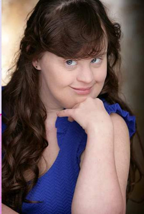
Jamie Brewer (attached)

An artist through and through. Inquisitive, sensitive and bright. With unbounded spirit, Emilia is ever the loyal and loving friend and devoted daughter. She is a compassionate and inspiring woman, and one who simply refuses to let her Down syndrome define her. All her insight and strength can't save her from heartbreak, though. After losing both her beloved parents, Emilia leaves behind all she's ever known and loved - her friends, job and art studio - moving in with her enigmatic aunt who lives out in the middle of what seems like—nowhere.